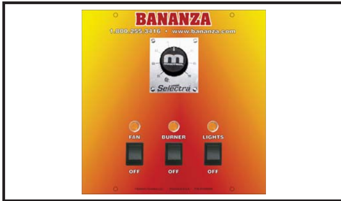
Basic II (Spray) Remote