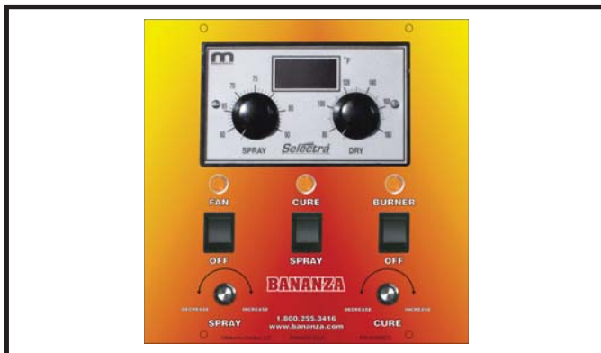
Digital Dual #1 Remote