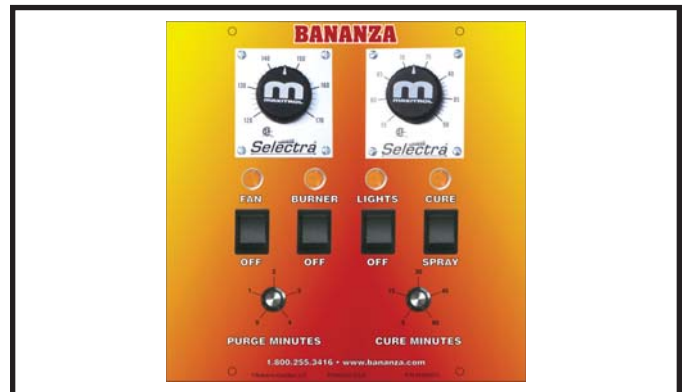
Dual #2 Remote