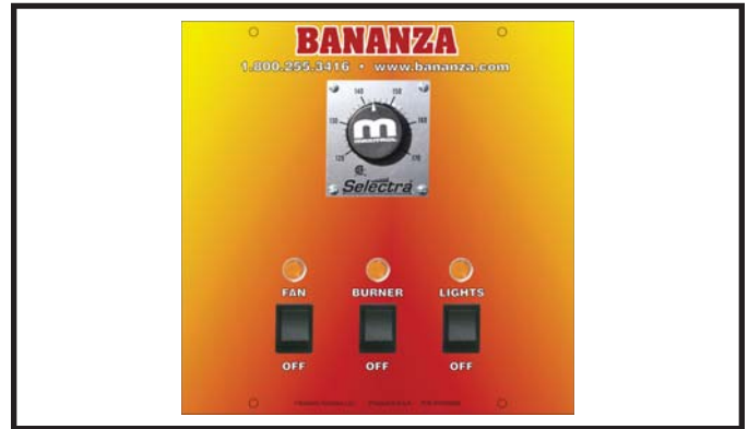
Basic II (Cure) Remote